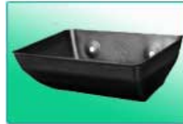
STARCO Steel Agricultural & Industrial