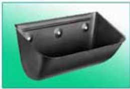
COLUMBUS DIN 15232 Steel Agricultural