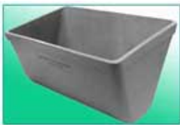
D TYPE Deep Pattern Industrial