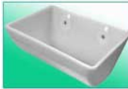
SUPER STARCO HDP/Nylon/Polyurethane Agricultural & Industrial