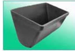
C TYPE Medium Deep Pattern Agricultural & Industrial