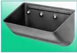
J TYPE American Grain Steel Agricultural

WEARCO NSW, supply an extensive range of elevator components manufactured by internationally recognised pressed steel and industrial plastics component Braime Elevator Components.