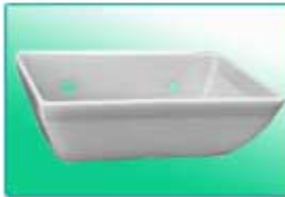
STARCO HDP/Nylon/Polyurethane Agricultural & Industrial