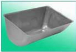
SUPER STARCO Steel Agricultural & Industrial