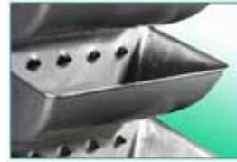
STARCO JUMBO Steel Agricultural & Industrial