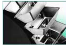
GB SPIDEX Bottomless Steel Powdery/Sticky