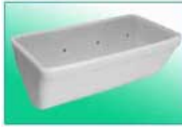
CC-S (Stackable) American Grain HDP/Nylon/Polyurethane Agricultural & Industrial