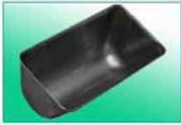
A TYPE Shallow Pattern Powders