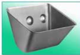
CONTINENTAL DIN 15233 Steel Industrial